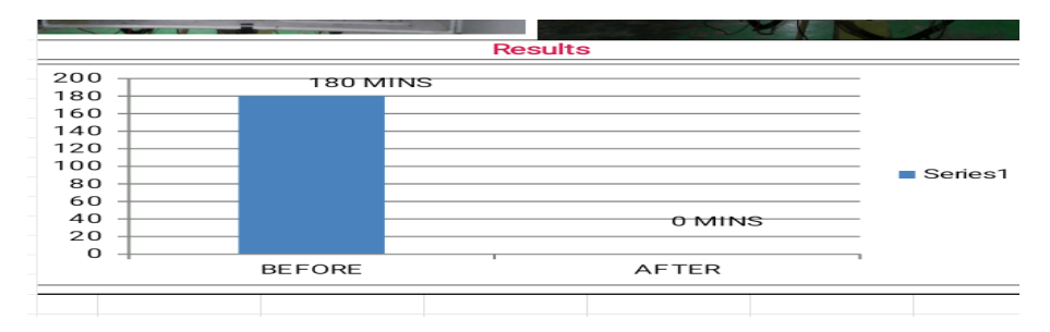
Figure 3.proposed system heater failures

The above graph shows the data for the proposed system heater failures. As we have analysed the process and the design of the heater structure in the existing method the heater failures where up to 180 minutes, so there was a loss in the production and the time to repair was also more and there is also more capital loss then these are used after the production is high.